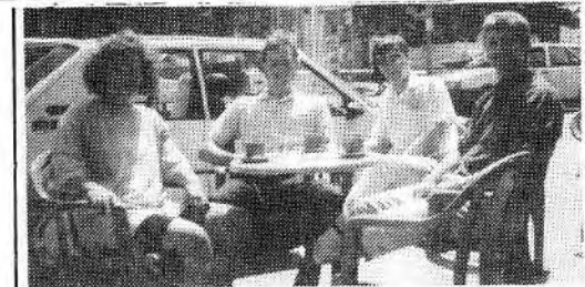
The team enjoy a pre-bridge coffee at one of Deauville's many pavement cafes.

By French standards, Deauville is an exclusive, expensive resort but having said that, a 3 Star hotel room costs under £20 per head per night but rooms for half this price can be obtained in neighbouring Trouville which is a 20 minute walk away or 4 minutes by car.